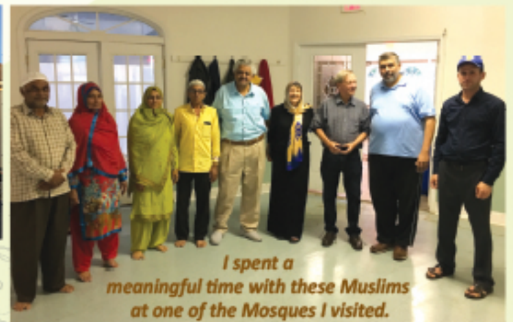
I spent a meaningful time with these Muslims at one of the Mosques I visited.